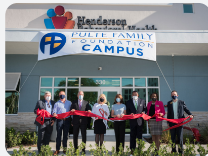
CSU and Centralized Receiving Center at The Pulte Family Foundation Campus